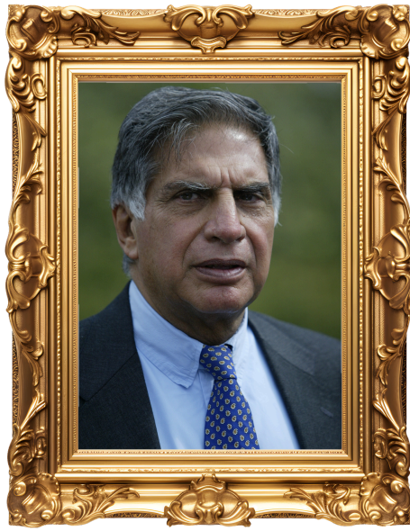
Ratan Naval Tata

"...a visionary business leader, a compassionate soul and an extraordinary human being. He was an iconic leader whose passing leaves a void in India's industrial and philanthropic landscape. His pioneering efforts in promoting home-grown industries have fortified the vision of Aatm Nirbhar Bharat, fostering cutting-edge technologies and indigenous capabilities..."